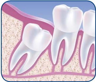
Soft tissue impaction of third molar.

In most cases, it is recommended that impacted wisdom teeth be extracted. Depending on the position of the tooth, third molar or wisdom tooth removal can be performed in your dentist's office, at an outpatient surgical facility, or in a hospital.